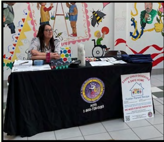
Above: RX Kids Event