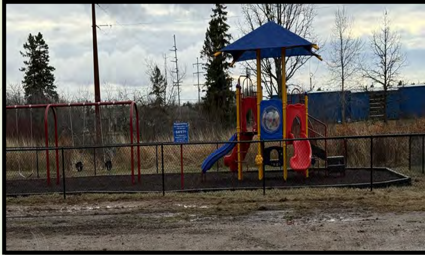
Above: Lodge of Hope – addition of new playground.