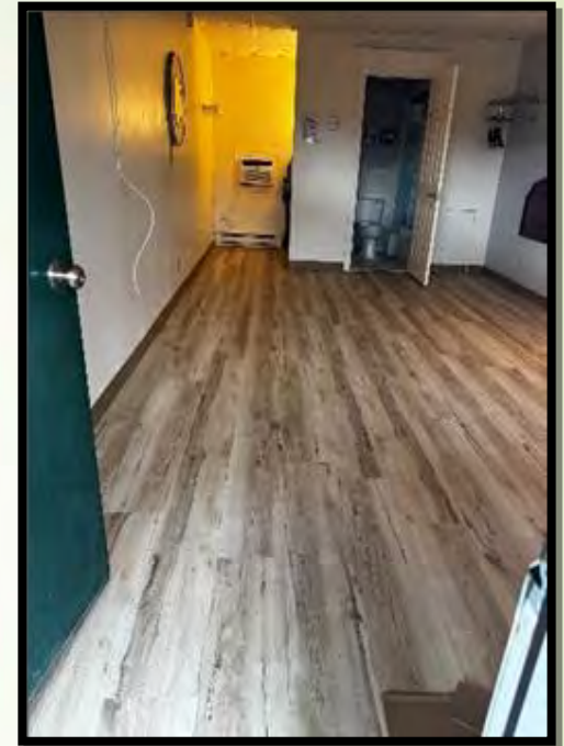
Below: LOH floor replacement project.