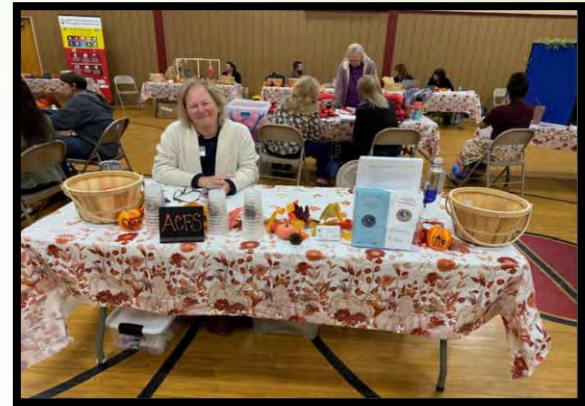
Above: Kinross Health Fair Below: Sault Health and Safety Fair