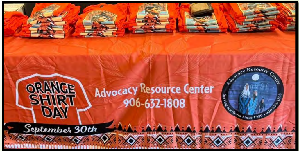
ABOVE: Orange Shirt Day event in collaboration with the Sault Tribe Culture and Language Department