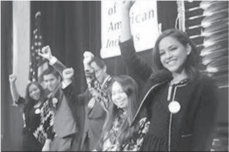
American Indian Youth from across the county selected for recognition by the Aspen Institute, a program established by former Senator Byron Dorgan (D-North Dakota).

Notwithstanding this immature Board opposition defiance, I will continue to work hard at all levels to represent you and to work to gain even higher levels of access to push our Sault Tribe agenda at the highest level. What good it does it do our Tribe to continue to undermine the office of the Chairperson?