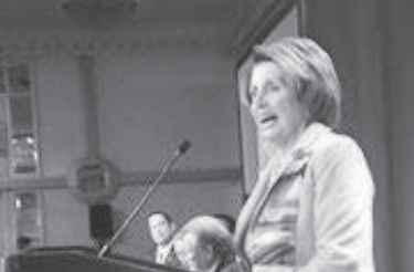
U.S. House Minority Leader Nancy Pelosi addressing the NCAI General Assembly.

member who rolls up his sleeves and a leader at the national level. I know I have the support of my fellow