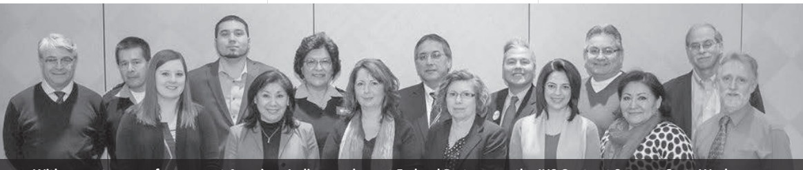
With a great group of very smart American Indians and smart Federal Partners on the IHS Contract Support Costs Workgroup

cern. Because you see, you put me here, not them. There exists a faction on our Board who have repeatedly opposed my requests related to change meeting times to accommodate my national level work.