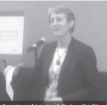
Secretary of Interior Sally Jewell talking about the importance of providing our Native youth opportunities.

Chairpersons as evidenced in their votes to appoint me several State, regional, and National posts. I also know I have the strong and steadfast respect of those I oversee and supervise, and provide ministerial oversight. Recall that not that long ago, nearly a landslide of support from you ~ the people ~ was demonstrated in the last election. So what is the problem with the