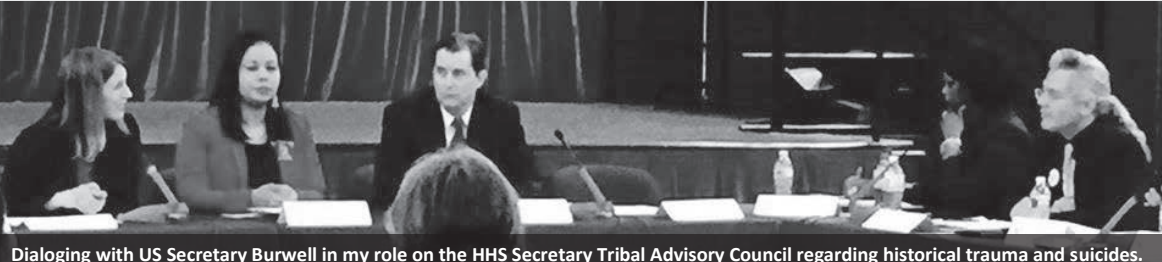
Dialoging with US Secretary Burwell in my role on the HHS Secretary Tribal Advisory Council regarding historical trauma and suicides.