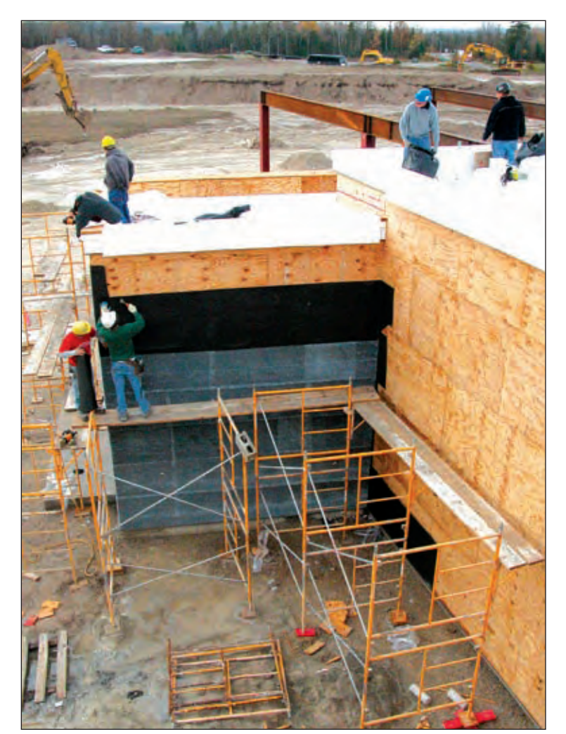
Siding attached. Workers attached the siding and insulation to the complex. Almost 80 percent of the 500 construction workers who worked at the site were local residents from the over 40 subcontractors who participated in the construction of Kewadin Shores Casino and Hotel.