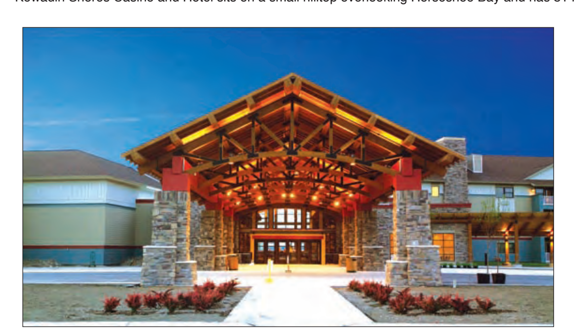
The main entrance to Kewadin Shores.