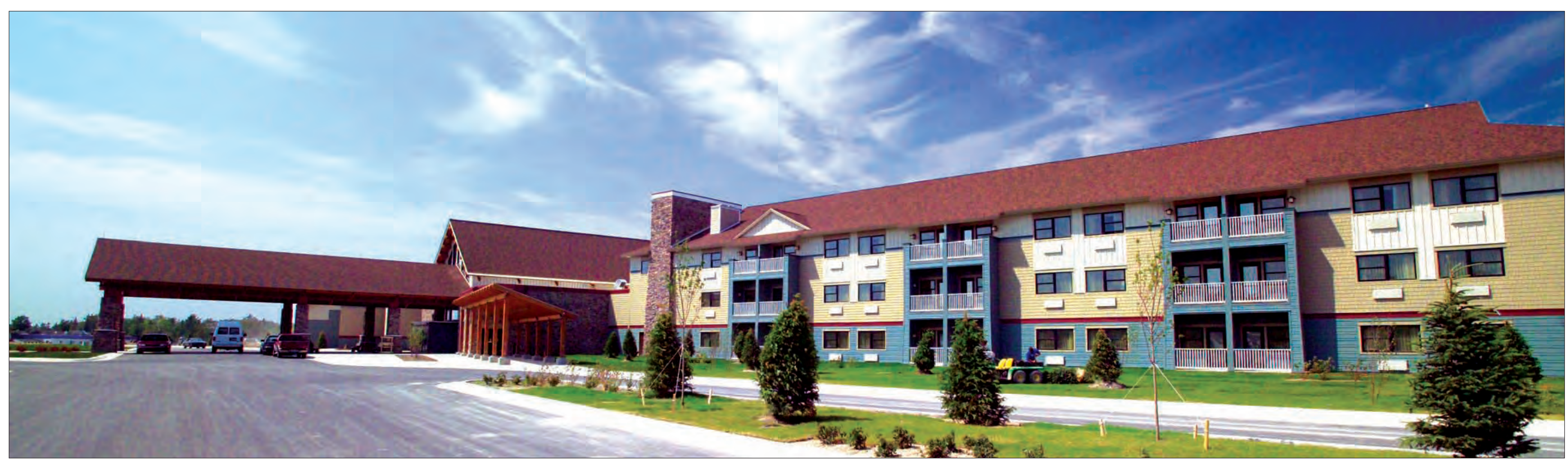
Kewadin Shores Casino and Hotel sits on a small hilltop overlooking Horseshoe Bay and has 81 rooms, a conference room, breakfast nook, 225 seat restaurant, gift shop, deli, two bars, a workout room, game room and swimming pool.