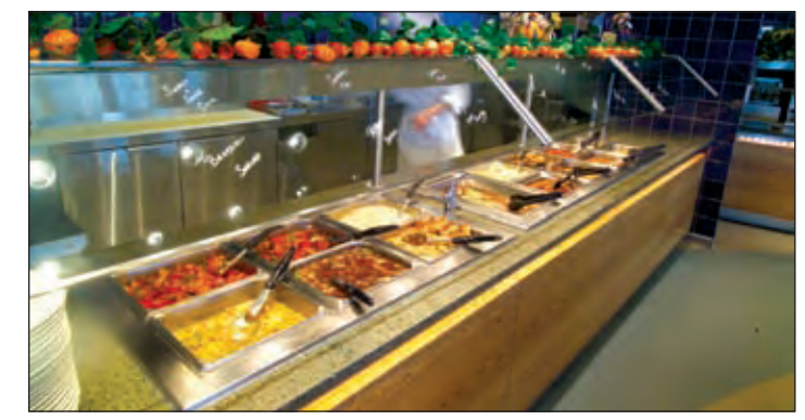
The buffet at the Horseshoe Bay restaurant starts out with on site prepared oriental foods and moves around the globe to Mexican, Italian and local dishes.