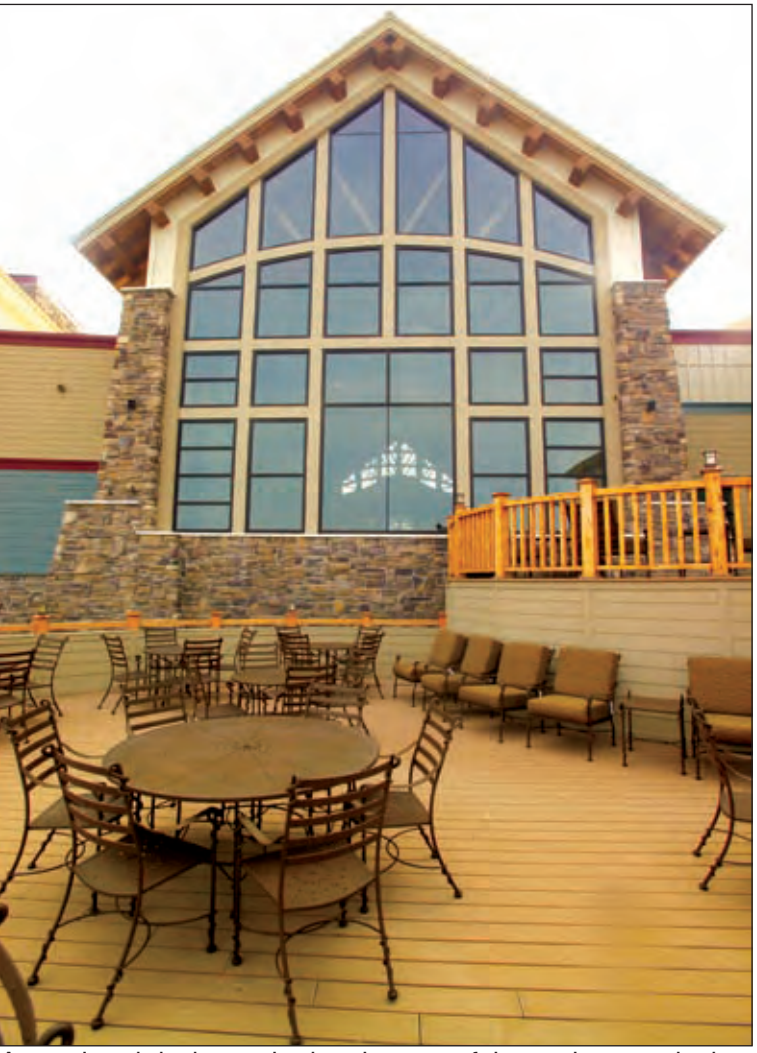
A two-tiered deck attached to the rear of the casino, overlooks Horseshoe Bay, offering a spectacular area for visitors.