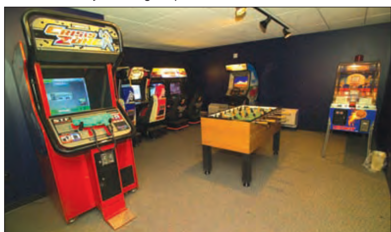
A full action game room, above, and a fully equipped work out room, below, are available at the hotel for guest use.