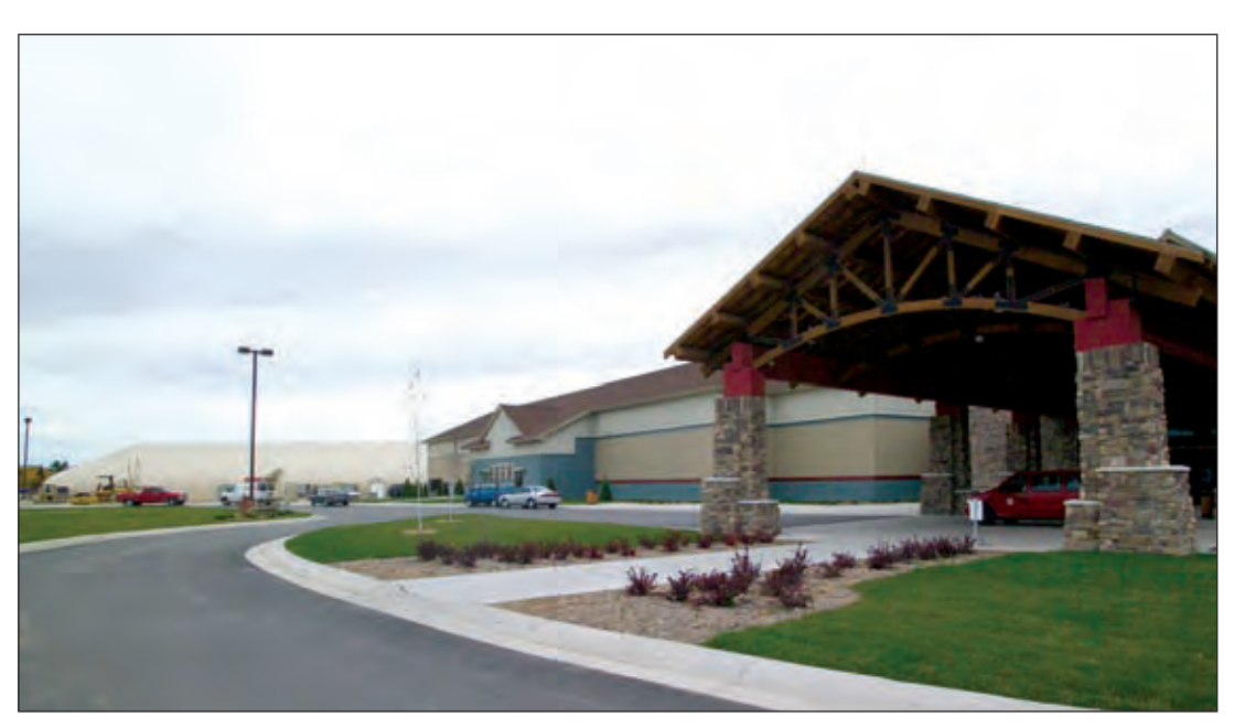
The new Kewadin Shores casino sits on the north side of the hotel, left in photo, and entertainment complex, (at left in photo).

"We want to give our congratulations to Kewadin Shores Casino and wish you the very best"