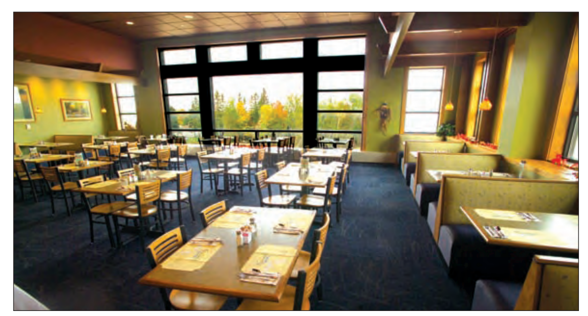
Kewadin Shores Casino and Hotel offers a full range of dining pleasures that are sure to satisfy the hunger of the traveling gourmets. The Horseshoe Bay Restaurant, above, offers a multi-cuisine buffet for breakfast, lunch and dinner and a full menu. The buffet, below, features action stations and a multitude of choices sure to please even the pickiest eater.