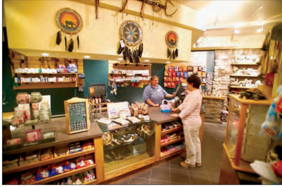
The Eagle Feather Gift Shop, located to the left of the casino entrance, offers guests a variety of unique gifts, hand crafted items and snacks. Be sure to stop in during your visit to the casino! A beautiful view of Horseshoe Bay and Lake Huron is there for the looking from the deck, restaurant, Whitetail Bar and rooms on the east side of the hotel.