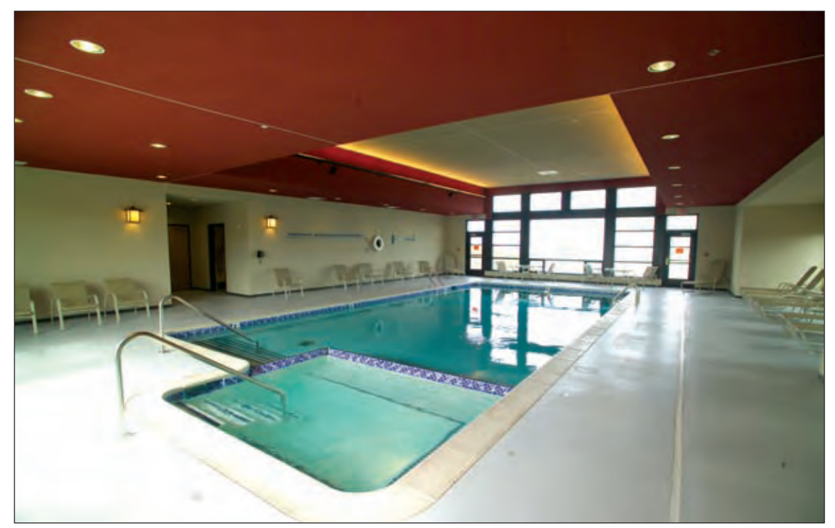
A year round pool and whirlpool which overlooks beautiful Horseshoe Bay is the perfect spot to relax after a day of gaming excitement.