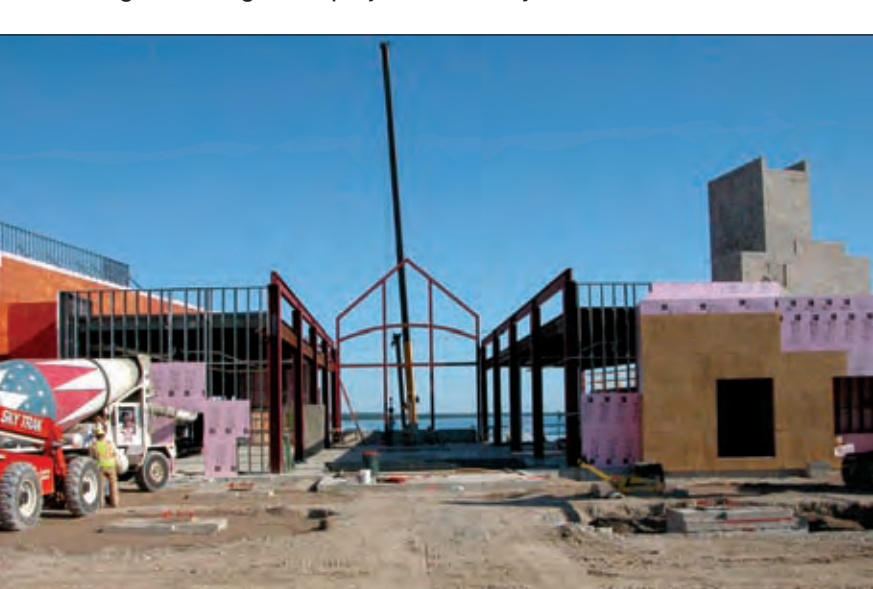
A crane raises the window frame to the rear of the lobby which overlooks Horseshoe Bay. The casino, entertainment room and restaurant are on the left with the hotel complex and lobby on the right.