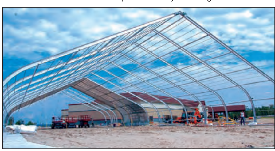
The new casino. The frame was erected in June of this year to enclose the new 25,650 square foot gaming hall.