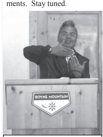
Using my MI Map to demonstrate our 1836 Treaty Boundaries during a presentation to MI CAPP (Michigan College Professional Access Programs & Personnel). Programs like Upward Bound and other TRiO programs participate in this association.

At the time I write this, I had placed on the agenda an action item to appropriate an amount of just over a quarter of a million dollars to do capital improvements on our Midjim in St. Ignace. While there was a proposal to build a new Midjim some 500 feet from the existing facility at a costs of $1.2 Million, after six months the proposal failed to be approved. Realizing it would never be approved, I chose to request the funds to do improve-